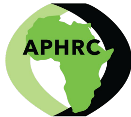
African Population and Health Research Center