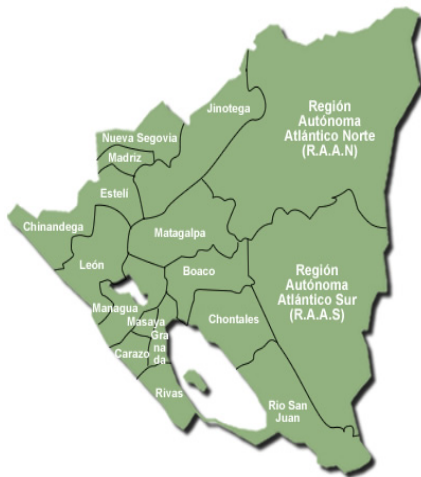
Figure 1 Map of SILAIS, Nicaragua

This report presents key results of two assessments of the availability and use of emergency obstetric care in Nicaragua: a national level assessment which gathered data from all health facilities which provided obstetric care in 2006, and an assessment of a three-year emergency obstetric care project jointly sponsored by the Ministry of Health, the United Nations Fund for Population and the Averting Maternal Death and Disability project at Columbia University (MOH/UNFPA/AMDD). This Project was carried out between 2002 and 2005 in the following three SILAIS; Chontales, Jinotega and Rio San Juan (Figure 1).